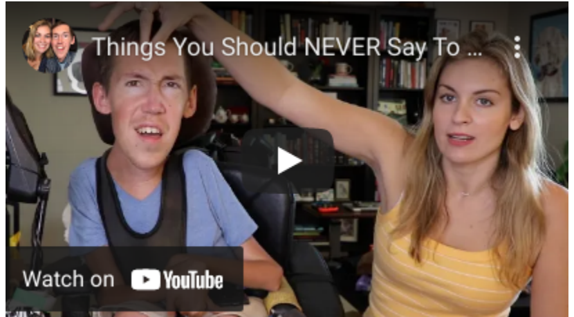
Things You Should NEVER Say To A Disabled Person - YouTube

This video content has been made available for informational and educational purposes only. Office of Accessibility and The University of Akron does not make any position with respect to the accuracy, applicability, fitness, or completeness of the video content.